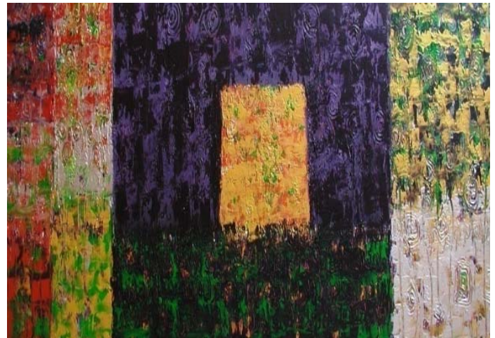
Salima Luna Ghazzal Raoui "Places of the Heart" Acrylic 120cm x 40cm