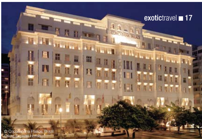
© Copacabana Palace, Brazil Orient-Express Hotels

Terre is the perfect place to unwind after a hectic year. It maintains an authentic feel and complements its environment, with its large courtyards, palm-trees and unique Riad-style homes – each created using an eight-sided variation of traditional and modern Moroccan architecture. The emphasis is on privacy, and it is ideal for spending quality time with a partner or close friends, basking in the sun by the poolside. The villas are spread over the resort, so you can have a secluded area for your New Year celebrations. The Royal villas even offer a private chef to create anything you wish, perhaps to take as a picnic on an ascent of the Atlas Mountains for an unforgettable experience. The hotel is renowned for its luxurious amenities with extremely attentive staff and all the facilities of a five-star resort. It is really an opportunity to relax playing familiar sports such as tennis or golf in beautiful surroundings; you can rejuvenate yourself for the year ahead by being pampered with an extensive range of beauty treatments at the renowned, world-class Esprite Nomade Spa. Be sure to