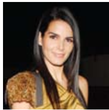
ANGIE HARMON ACTRESS