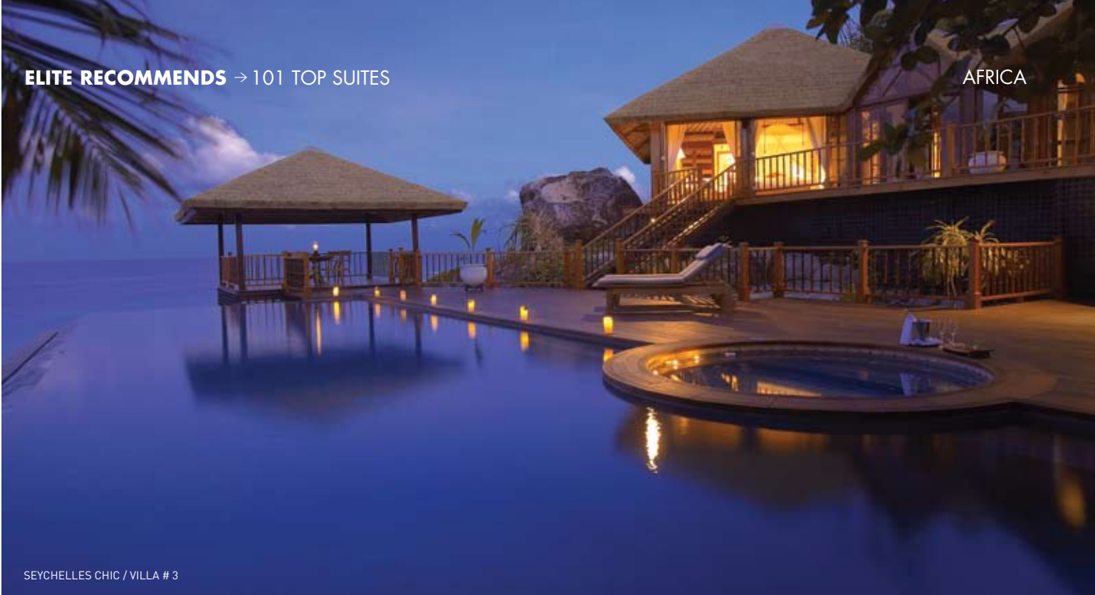
SEYCHELLES CHIC / VILLA # 3